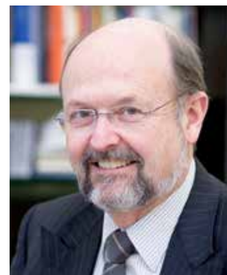
Luc Coene Governor

At 3.3 %, global growth once again fell short of expectations. Mounting geopolitical tensions in the Middle East and Ukraine are only part of the reason. The global economy is in fact struggling to leave the crisis behind and is still battling with excess capacity, or in other words under-employment, seven years after the crisis began. So is the global economy, or part of it, facing secular stagnation owing to a persistent mismatch between savings and investment ?