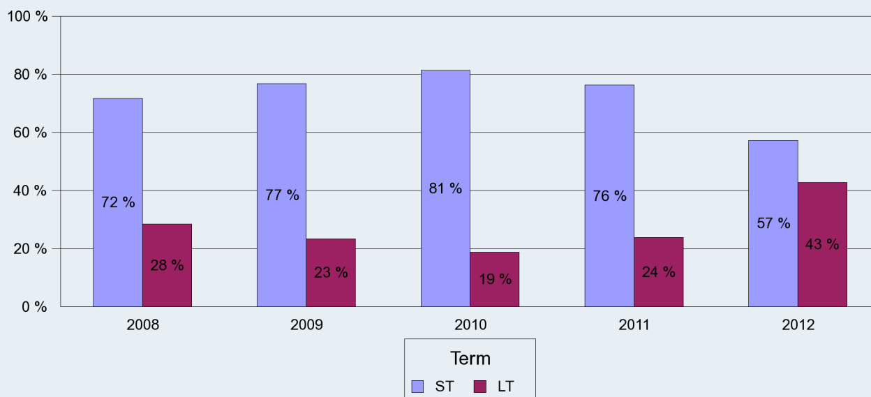
Ratio Short Term (ST) vs Long Term (LT) on total issued amount