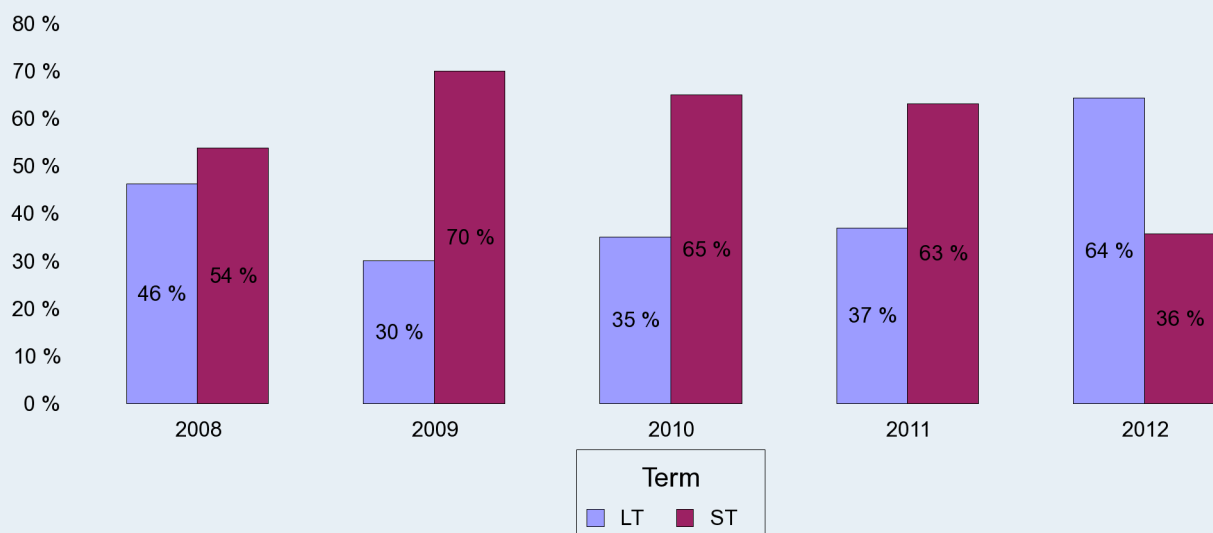
Ratio Short Term (ST) vs Long Term (LT) on issued amount: Belgian Government Securities*