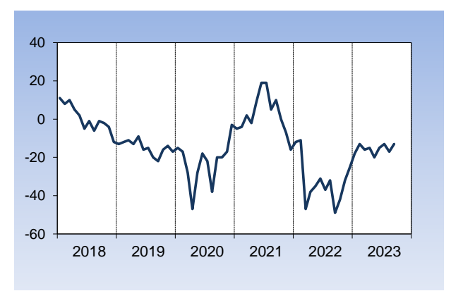
Financial situation of households