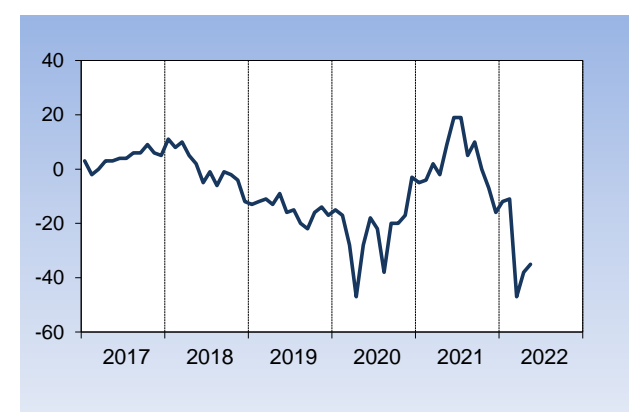
Financial situation of households