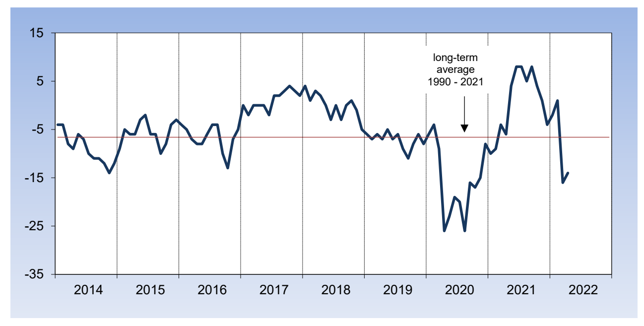
Expectations for the next twelve months