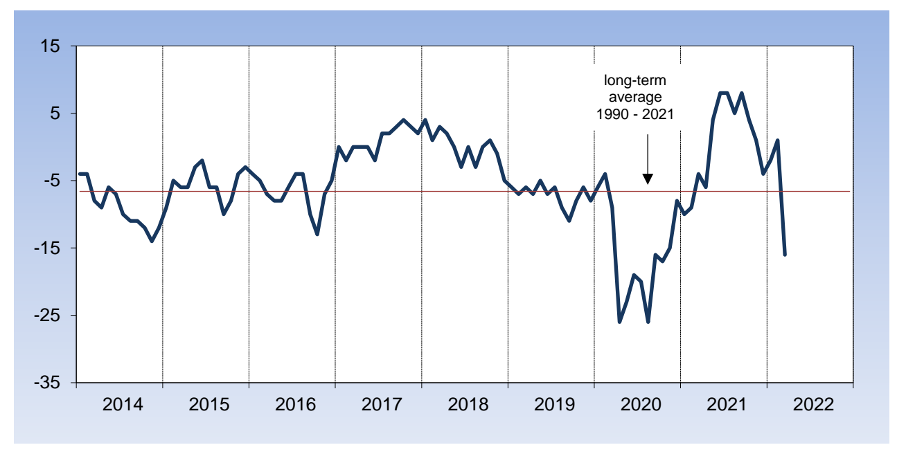
Expectations for the next twelve months